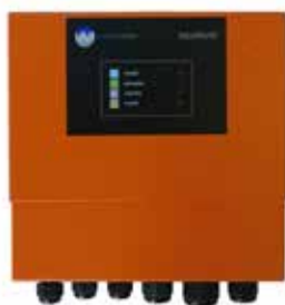
Magellan Solar Gate

The above case study shows that installing solar power and energy storage equipment in a commercial building is a very effective way of reducing the cost of electricity and provides an excellent return on investment (not including plant depreciation). The Australian made Magellan Commercial Scale Energy Storage System is also an Uninterruptible Power Supply (UPS) and due to its 4 quadrant capabilities can also improve power quality by correcting the load power factor which can also reduce cost of electricity cost.