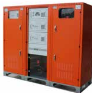
Magellan Commercial Energy Storage

Magellan has been supplying high quality AC and DC back-up power systems to Australian industry since 1991. Our expertise is design and manufacture of customised AC and DC power systems, and since 2009 Magellan has been also supplying energy storage systems to utilities and solar projects. Magellan has been in business for 24 years, and many of its original power systems which were manufactured in the 1990's are still in operation at various Australian and international substations, which is a testament to Magellan's reliability.